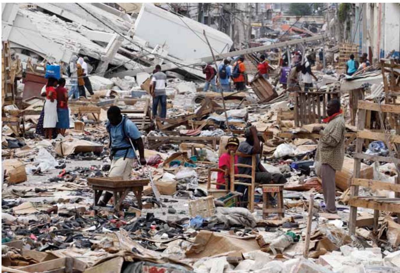
Residents of Port-au-Prince find a path through fallen buildings that used to be their city streets.

The Haiti earthquake will go down in history as one of the most devastating natural disasters of our time. The challenges of operating in the ruins of a cramped city, with accumulated rubble and massively damaged infrastructure have been almost insurmountable. But I am proud to say that Oxfam and other agencies have risen to this challenge. We have adapted tried-and-tested approaches in new areas and, together with our partner organizations and Haitian staff, have found strength in our ability to tackle obstacles and come up with creative solutions.