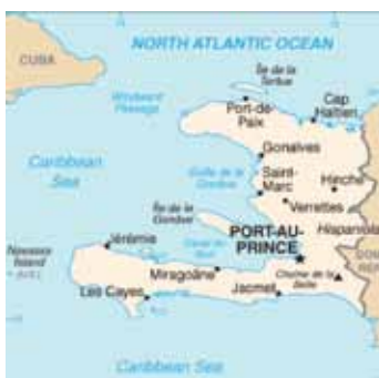
Port-au-Prince and surrounding areas in Haiti where Oxfam works.