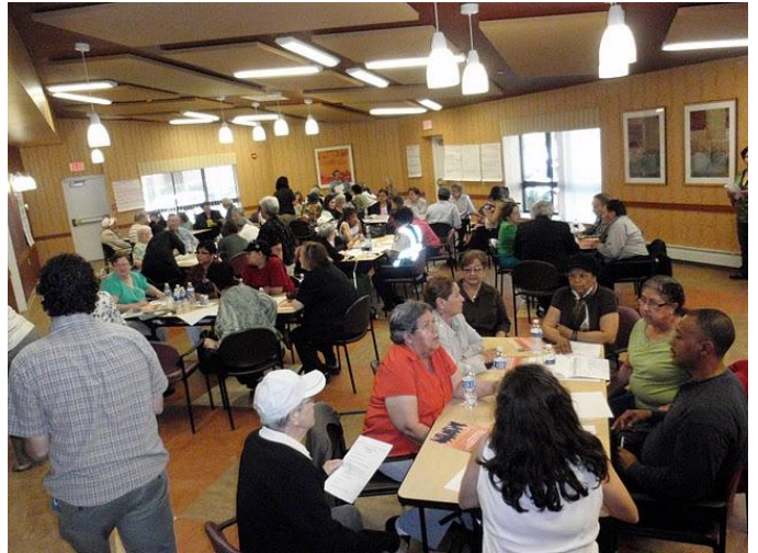
Small group discussion table

The purpose of the meeting was to provide information, raise awareness, identify health concerns, and develop possible solutions to address the health of older adults.