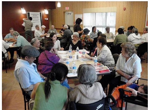
Spanish-speakers small group discussion table