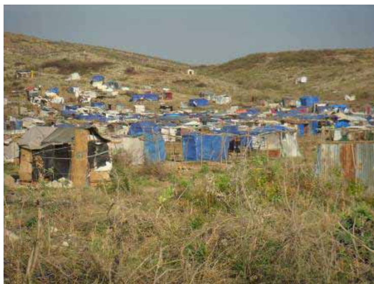
Many new camps were established in the environs of Port-au-Prince in the aftermath of the earthquake.

According to Government estimates, over half a million people left Port-au-Prince in the days following the earthquake. In order to maintain the attractiveness of the regions, the UN team decided to make shelters available on a preferential basis to those who moved to the interior. It was also decided that all relief agencies and NGOs would provide essential support services – food, health, education, employment and counseling – in the regions. In addition, a system for host family support was initiated, whereby any family in the interior that was housing a displaced family member from Port-au-Prince would be given a lump sum, plus a monthly allowance to support them.