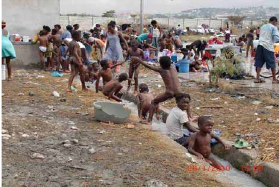
In the absence of adequate sanitation facilities in the camps, children bathe wherever they can find water.