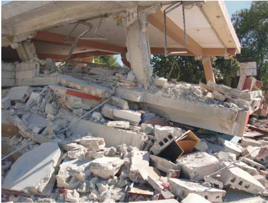
Concrete hollow bricks were often incorrectly used as load-carrying building material, and collapsed easily during the earthquake

Concrete is such a popular building material in Haiti that it is used in all new construction work – for walls, roofing, floors, compound walls and columns. A number of key advantages help to explain why it is preferred over wood: