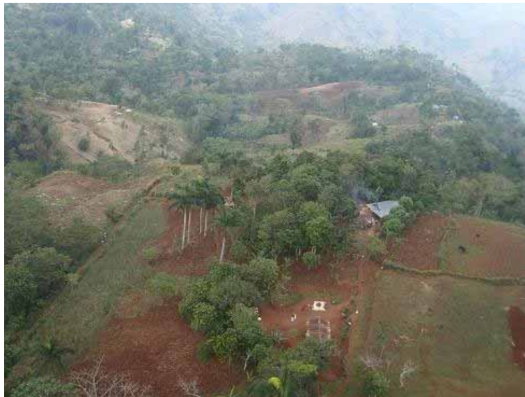
Significant soil erosion caused by deforestation reduces the ability of top soil to support vegetation.

With current knowledge about the chemistry and geology of the rocks and climatic factors, the following situation can be predicted with some certainty.