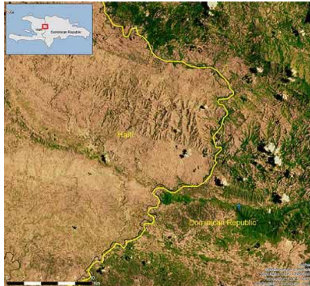
Severe deforestation in Haiti is clearly contrasted with the forest cover across the border in the Dominican Republic.

soil erosion. Haiti's very sustainability had been significantly eroded by resource degradation, including severe deforestation. Environmental governance in the country was also facing severe constraints due to a lack of comprehensive legislation, institutional capacity and the wider economic reality of the country, which had relegated environmental management far down on the list of governmental priorities.