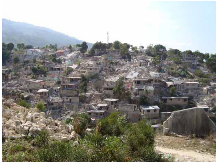
The presence of a fault line beneath the hills of Pétionville makes the area unsuitable for resettling impacted populations.

In addition, there was consensus between communities, the Government and NGOs that settling displaced people in low-lying areas around the city was not practical, given the real risk of flooding from heavy rains or cyclones.