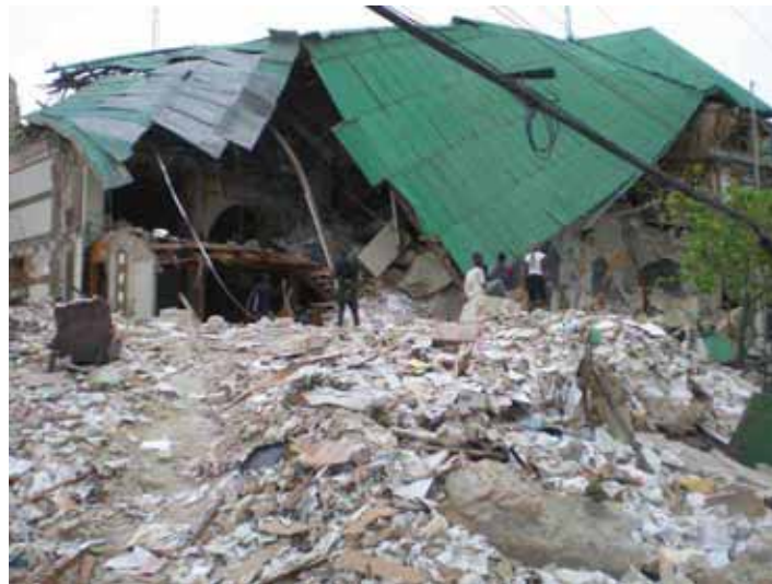
The Haitian Government infrastructure was seriously impacted by the earthquake; above, the remains of the Ministry of Environment.

In addition to the severe damage in Port-au-Prince, several cities and villages in the south of the island were impacted, resulting in extensive death and destruction. The Government has estimated that some 250,000 residences and 30,000 commercial buildings collapsed or were badly damaged. The earthquake has thus led to significant population displacement, with many people, including some whose homes were not damaged, vacating the city and moving out into the open. The United Nations estimates that up to 1.9 million people are in need of food aid for the foreseeable future.