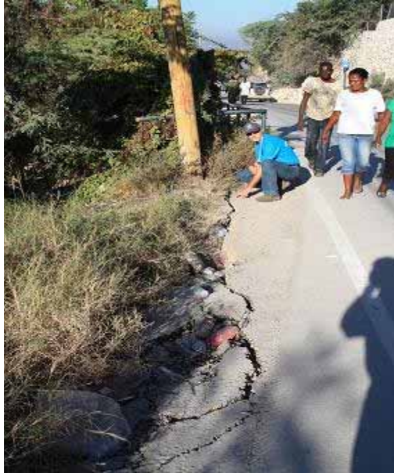
A UNEP expert inspects road damage in the days following the earthquake.

In 2009, working with the Government of Haiti, the William J. Clinton Foundation, the Earth Institute at Columbia University and various agencies of the United Nations, the UN Environment Programme (UNEP) formulated a comprehensive country-wide strategy known as the Haiti Regeneration Initiative (HRI), aimed at reducing poverty and disaster vulnerability in Haiti through the restoration of ecosystems and livelihoods based on sustainable natural resource management.