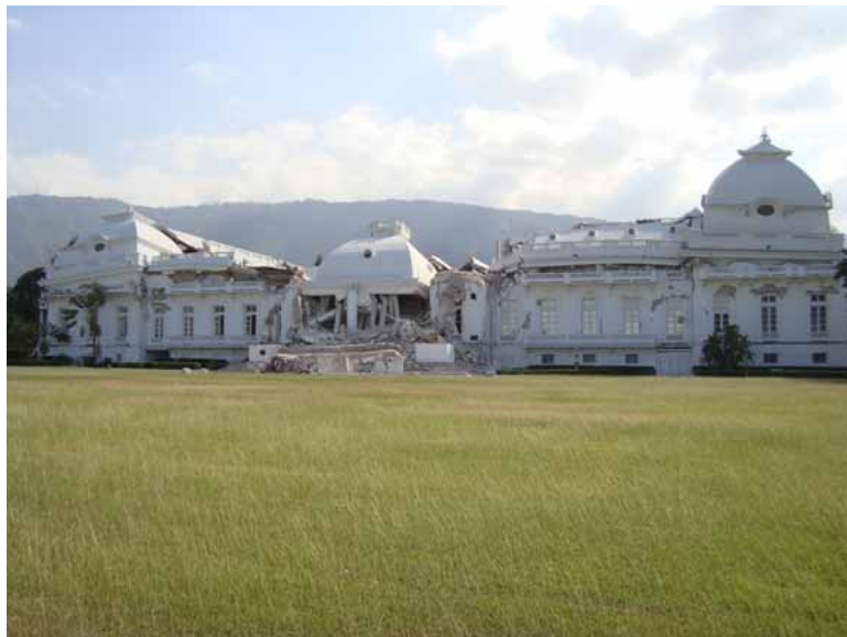
The presidential palace in Port-au-Prince was extensively damaged by the earthquake and will need to be demolished.

The initial response and, to some degree, the ongoing response to the disaster have been impacted by the trauma faced by the occupants of these “lifeline” buildings. Yet, reasonably designed and reinforced structures would have withstood a 7.0 magnitude earthquake, so the question needs to be asked of why these critical buildings did not. There are two main reasons for this.