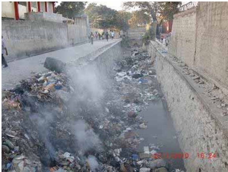
In many parts of Port-au-Prince, drainage channels are filled with solid waste. This causes localized flooding every time there is heavy rainfall.

In many parts of Port-au-Prince, the lack of municipal services for solid waste management has led to environmentally unacceptable situations. The worst example of these is the concrete drainage channel close to the main bus station in Carrefour, which is in many ways the most active part of the city, and one of the most economically important. The channel, which leads into the sea, is filled with garbage that has completely blocked the drain. In the event of heavy rains, the blockage causes the drain to flood, spreading the accumulated waste material throughout the crowded surrounding neighbourhood. Indicative of current relief efforts, the drain which was originally littered with remnants of urban life (plastic bags, tin cans, soft drink bottles, etc.) is now also full of the styrofoam packaging that is used to provide food supply to displaced communities.