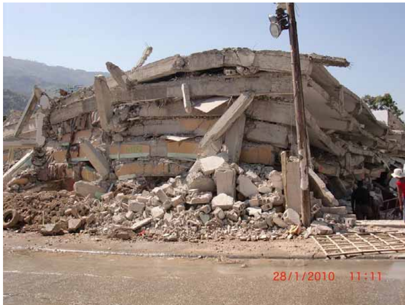
The earthquake caused multiple building storeys to crumble onto each other, compacting everything within.

The situation in Port-au-Prince presents a similar scenario to other earthquake-related disasters, with a large-scale destruction of buildings burying everything below. In addition, a number of buildings that are currently standing are unsafe for use and will need to be demolished, thereby producing even more debris.