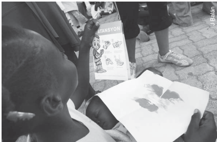
An art lesson comes with a public health message in a Cuban medical team outreach program.

By the end of 2010, nearly a dozen such 'triangular cooperation' agreements had been negotiated to support Cuba's health efforts in Haiti.