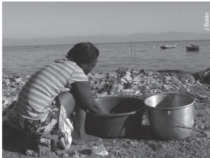
The waters of Haiti's Artibonite River: washing, bathing, cooking... and unsafe to drink.