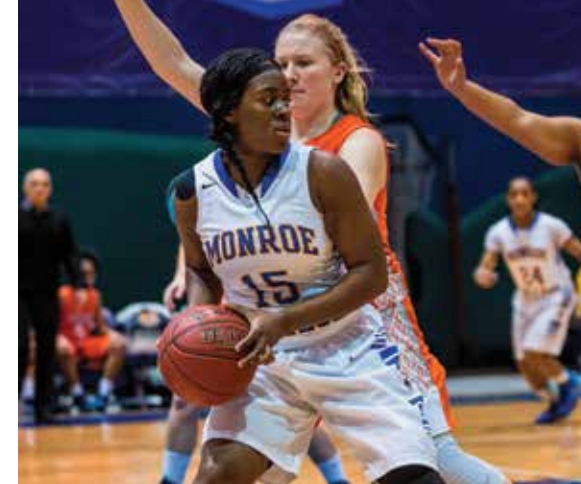
WOMEN'S BASKETBALL Division II

All Monroe teams are members of the National Junior College Athletic Association and participate in NJCAA Region XV.