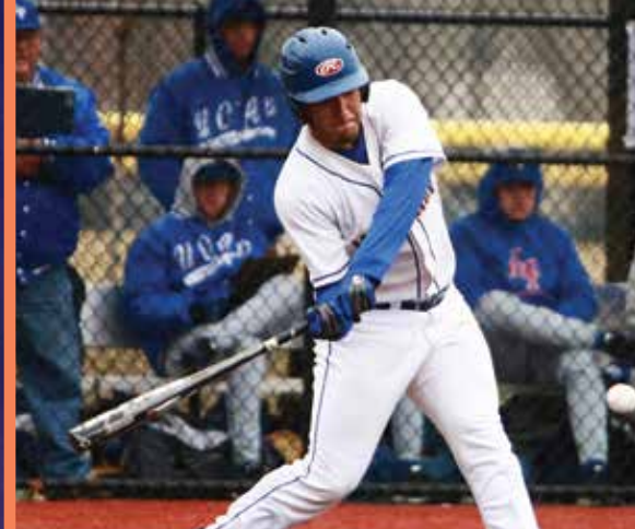
BASEBALL Division I