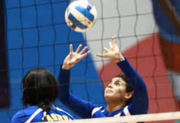
VOLLEYBALL Division I