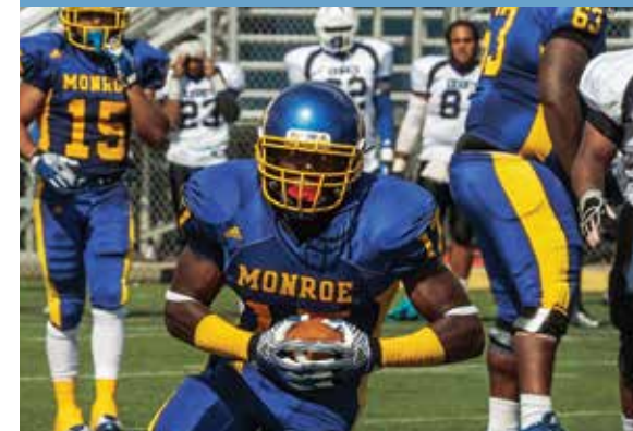
FOOTBALL Division I