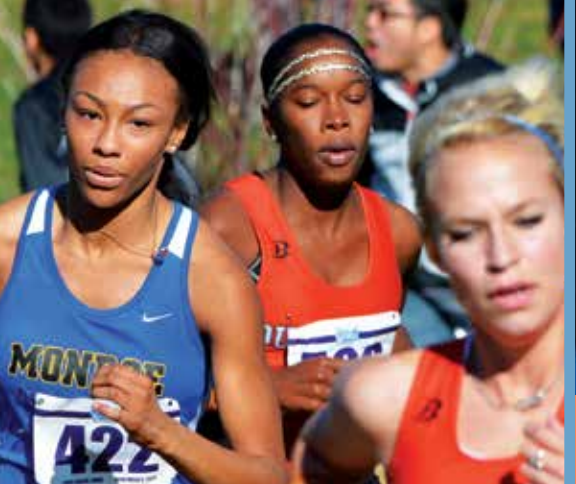
CROSS COUNTRY Division I