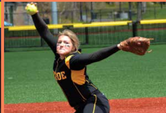
SOFTBALL Division II