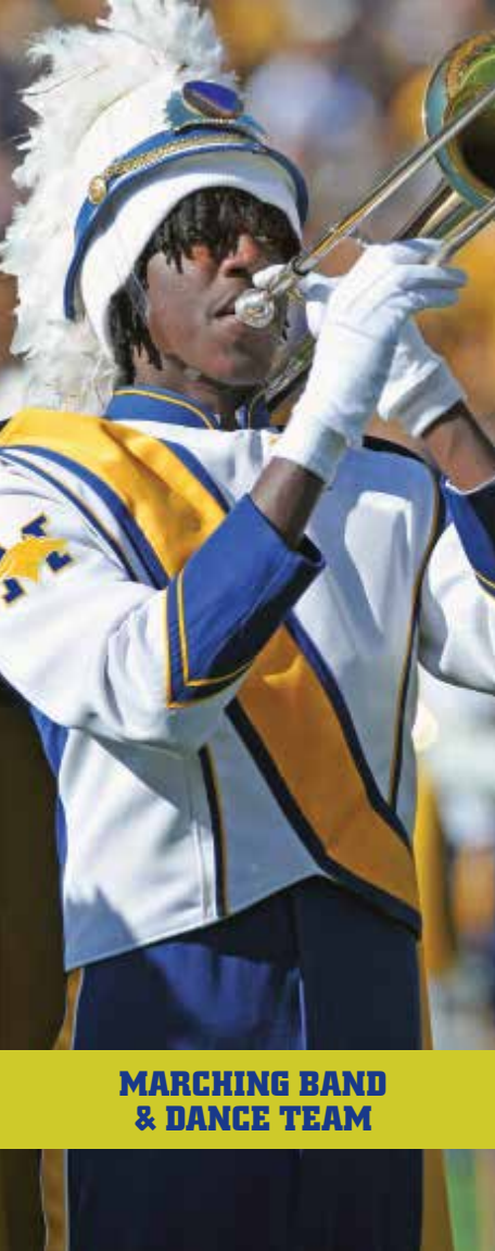
MARCHING BAND & DANCE TEAM