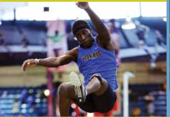
TRACK & FIELD Division I