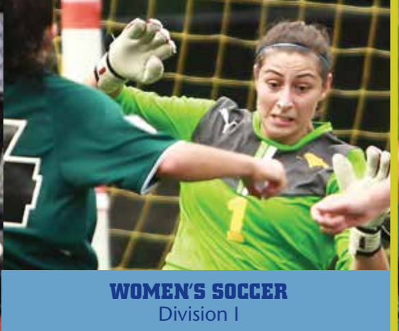
WOMEN'S SOCCER Division I