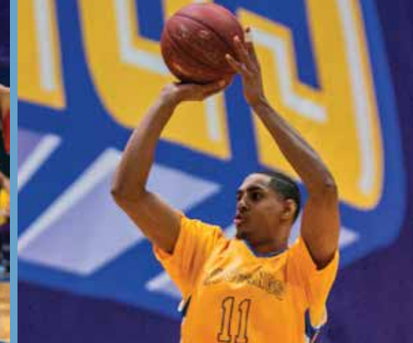
MEN'S BASKETBALL Division I